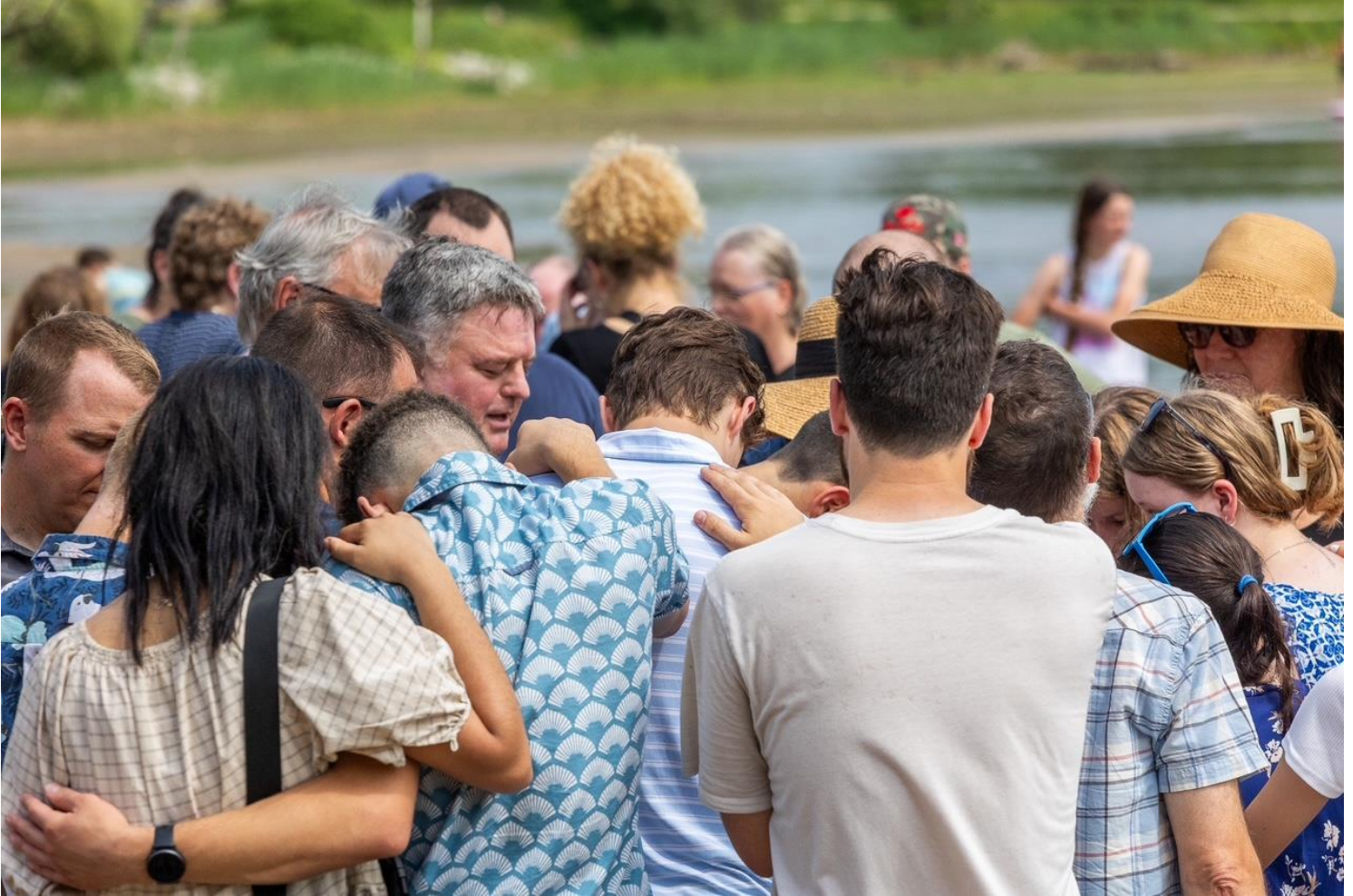
OSAC Baptism Service Kelso Beach June 22, 2025